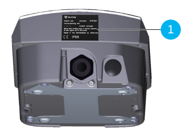
Figure 3.1: Bottom view of charging station